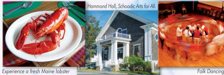
Hammond Hall, Schoodic Arts for All.

Visit www.schoodicarts.org & www.schoodicbyway.org for event information.