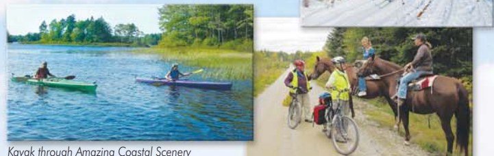
Kayak through Amazing Coastal Scenery