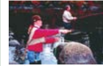
Fishing at Rocky Lake